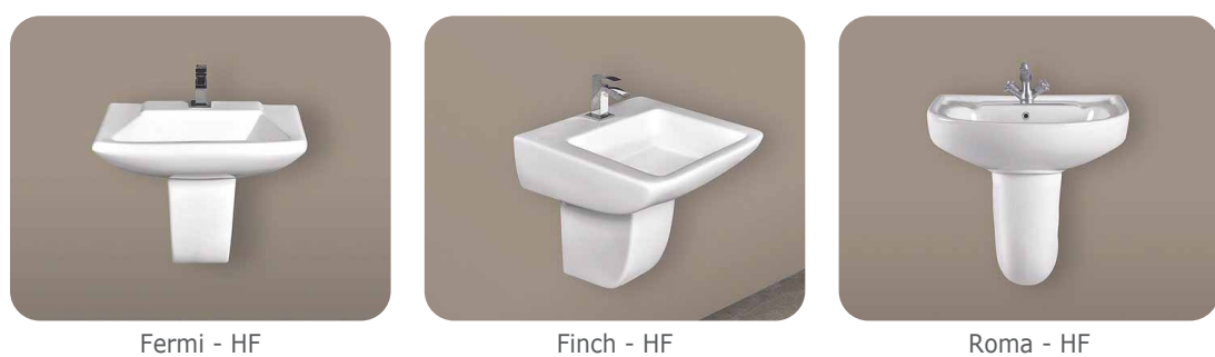
Finch - HF