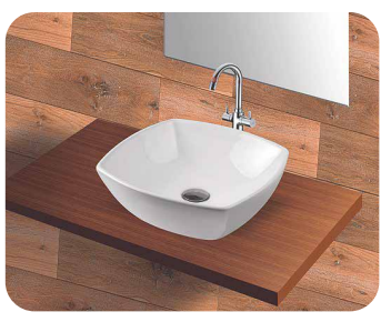
Table Top Basin