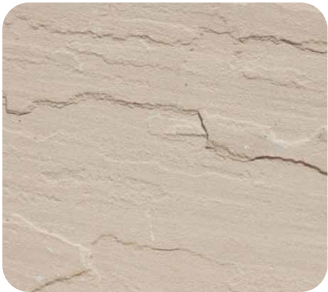
Dholpur Beige Sandstone