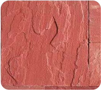
Dholpur Red Sandstone