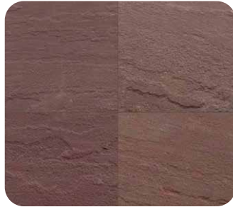
Mandana Red Sandstone