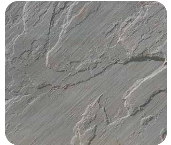
Lalitpur Grey Sandstone