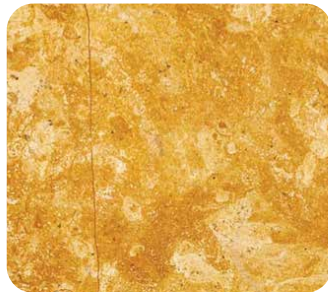
Yellow Flower Polished & Brushed