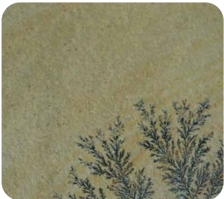
Fossil Mint Sandstone