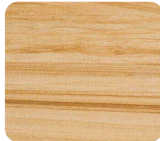
Teak Wood Sandstone