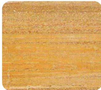
Ita Gold Sandstone