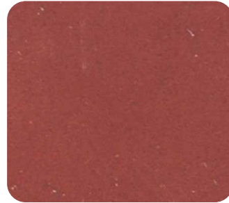
Jodhpur Red Sandstone