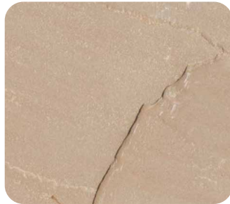
Automan Brown Sandstone